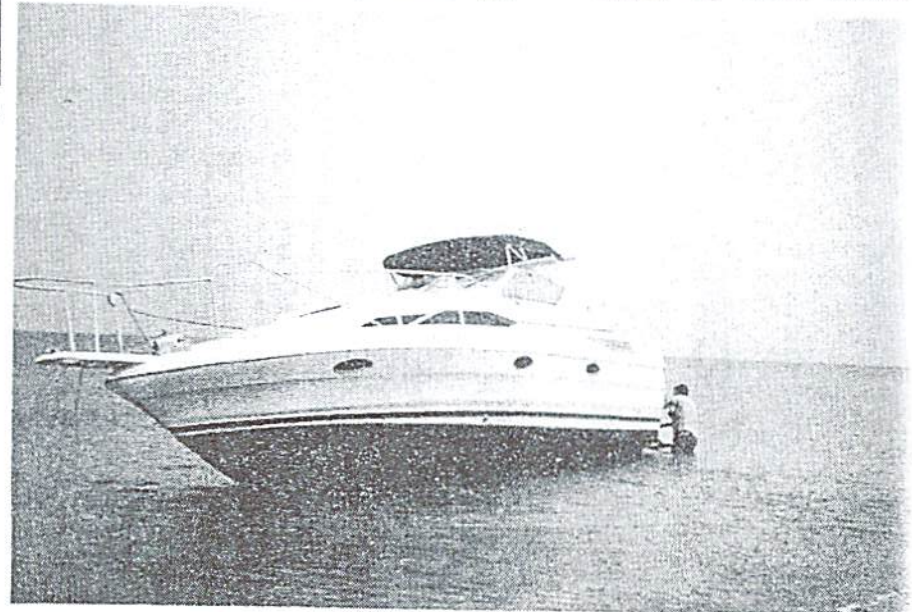
This Sea Ray from Marshfield was grounded off Duxbury Beach during Sunday's thunderstorm.